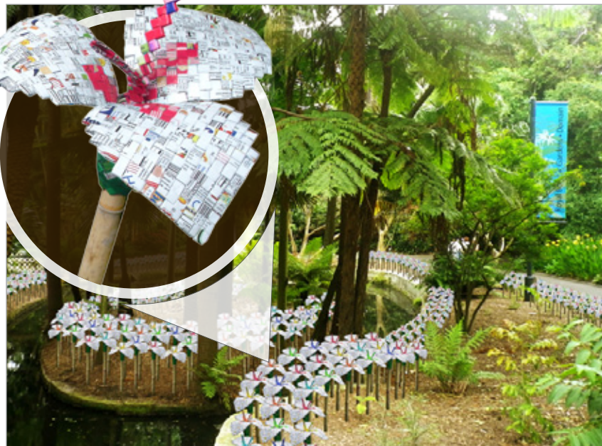
HUNDREDS OF FLOWERS MADE FROM RECYCLED RUBBISH FORM A PUBLIC ART INSTALLATION AT THE ROYAL BOTANIC GARDENS IN SYDNEY