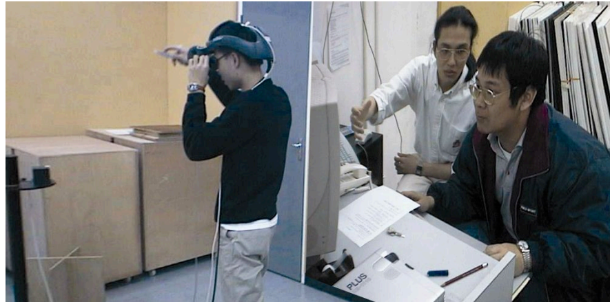
Figure 3 – The Virtual Environment Design studio. One student is designing, while the others watch and communicate with the remote side.

Recent initiatives between HKU and BUW have attempted to merge the concept of a Virtual Design Studio with the architectural tool of virtual environments (VE). VE refers to 3D immersive virtual environments for design, accessible through the use of virtual reality tools. In VeDS 2001 (Virtual Environment Design Studio), the designer wore a virtual reality headset and designed by making gestures while holding a magnetically-tracked stylus (see figure 3). The gestures were converted by the software (Virtual Reality Architectural Modeller - VRAM) into 3D forms.