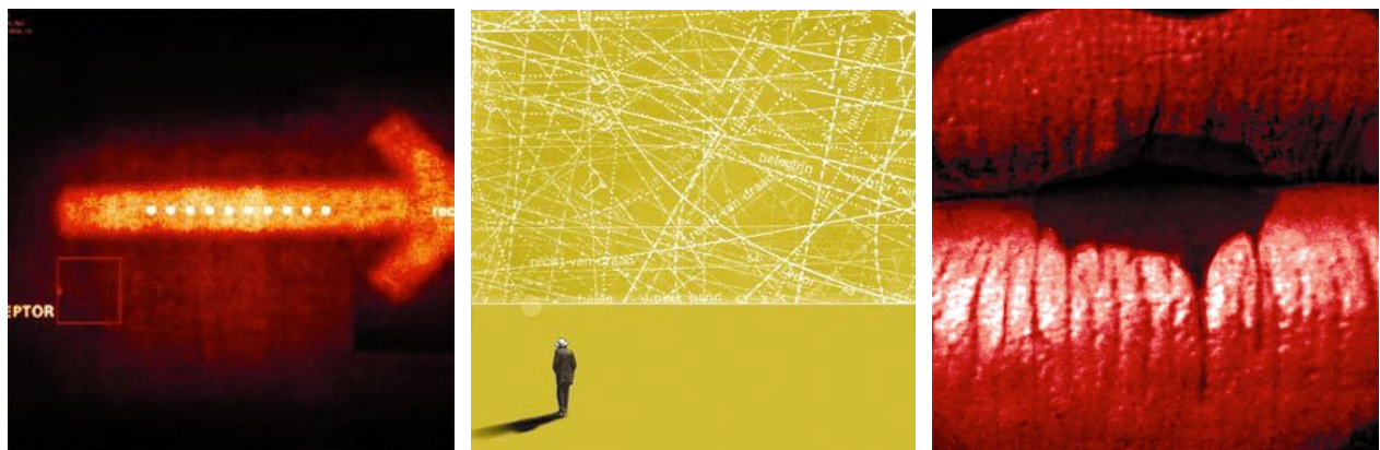
Figure 2 – Images produced by students during the first Omnium Project in 1999, in response to an ‘unravelling’ design brief. Student groups were firstly asked to respond visually to the words ‘small’, ‘red’ and ‘car’. Left to right: ‘Red’ by group Merak, ‘Small’ by group Merak, ‘Car’ by group Alya.

In 1999, the first Omnium Project from UNSW Australia, linked 50 design students from universities in 11 countries in a graphic design project titled ‘Omnium 1.0 - the Small Red Car’. An ‘unravelling’ design brief that focused on a comprehensive graphic design process rather than one end product differentiated this project from others (see figure 2). In addition, Omnium attempted to minimise technical difficulties by structuring all communication through a custom-built web interface 29 .